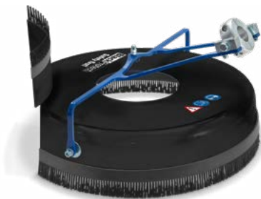
Patent: EP 2 241 173 B1